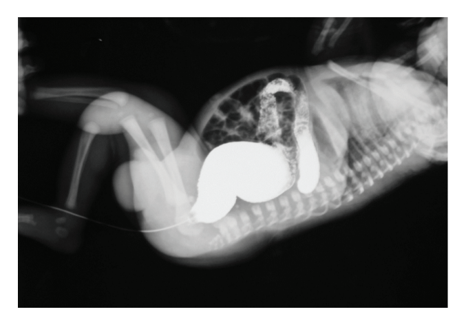
Figure 2 - Digital examination of the anus and anal dilatation were performed 2 weeks after surgery.

the bowel function recovered. Digital examination of the anus and anal dilatation were performed 2 weeks after surgery ( Figure 2 ). If there was no anastomotic stenosis, anorectal dilatation was performed once or twice per week for 1-3 months. If there was anastomotic stenosis, anorectal dilatation was performed once or twice a day until the stenosis disappeared. Barium enema was performed 3-6 months postoperatively.