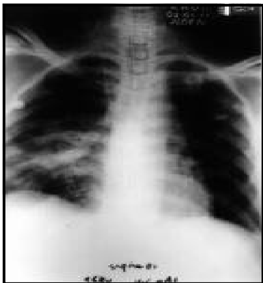
Figure 2 - CXR showing worsening of the pulmonary consolidation.