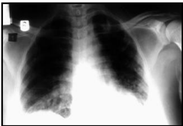
Figure 1 - CXR on admission showing right lung consolidation with air bronchogram.

agglutinin and mycoplasma culture were negative. Chest x-ray showed consolidation with air bronchogram in the right lower lobe and areas of calcification in the left upper lung (Figure 1). The patient was diagnosed as having community acquired pneumonia for which erythromycin and cefuroxim intravenously were given. Two-days later, pseudomonas aeruginosa was isolated from the sputum and then antibiotics were changed to ceftazidme and gentamycin. Initially patient's condition showed slight improvement as fever and cough subsided and the inspiratory crackles