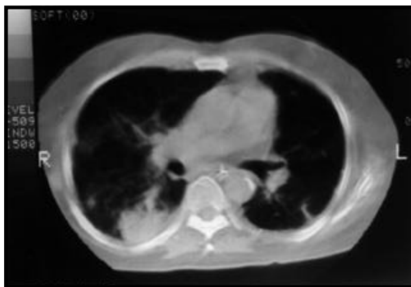
Figure 3 - Chest CT scan showing infiltration of the right and left lung.