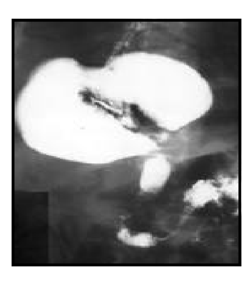
Figure 3 - Barium meal showing a large paraesophageal hernia with intrathoracic volvulus.

recurrent attacks of vomiting of one weeks duration, was found on barium meal to have a large left sided paraesophageal hernia with intrathoracic gastric volvulus (Figure 3). This patient was operated on as an emergency. He was found to have a large left sided paraesophageal hernia with almost the whole of the stomach inside the chest. The stomach was reduced and found to be congested but viable.