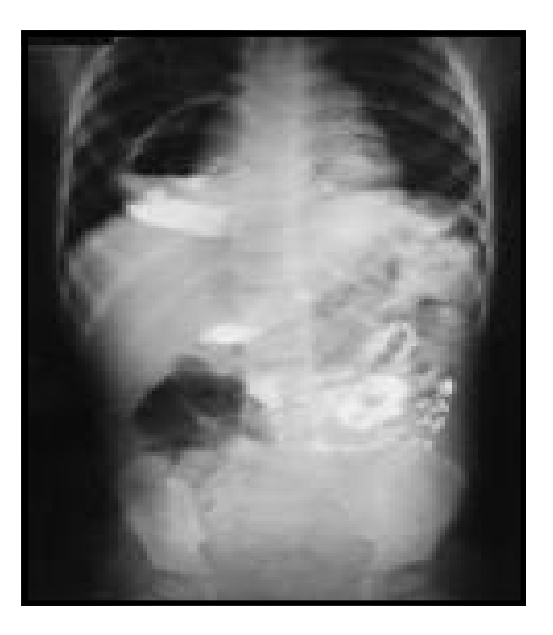
Figure 2 - Barium meal showing the stomach herniating on the right