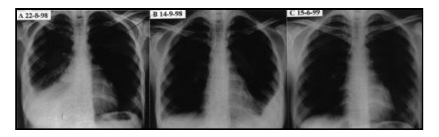
Figure 1 - (a) Initial chest radiograph showing moderate right sided pleural effusion. (b) Chest radiograph 3 weeks later showing moderate left sided effusion with resolving right sided effusion. (c) Chest radiograph 3 months after finishing antituberculous drugs showing minimal pleural thickening.

jaundiced and had signs of right sided pleural effusion. Laboratory tests showed normal full blood count with a high erythrocyte sedimentation rate (ESR) of 86mm/hour. Serum alanine (ALT) and aspartate aminotransferases (AST) were raised at 72 and 118U/L, serum bilirubin was normal. Chest xray showed right sided pleural effusion (Figure 1A). Ultrasound of upper abdomen was normal. Thoracocentesis revealed an exudative fluid with a lymphocytic reaction (cell count of 2100/mm<sup>3</sup>, 70% lymphocytes). Smear for acid fast bacilli was negative. Metoclopramide was given and antituberculous drugs were splitted with isoniazide and rifampicin given before breakfast while pyrazinamide and ethambutol were given after lunch. A closed pleural biopsy was planned but as her symptoms subsided and a repeat chest x-ray showed significant resolution of the effusion she was sent home on 2nd September on the same drugs.