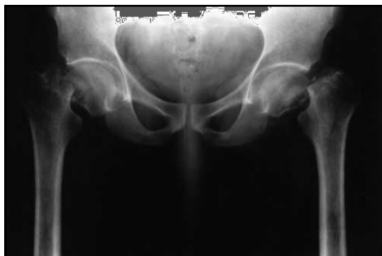
Figure 1 - Anteroposterior radiograph of both hips showing bilateral femoral neck fractures.