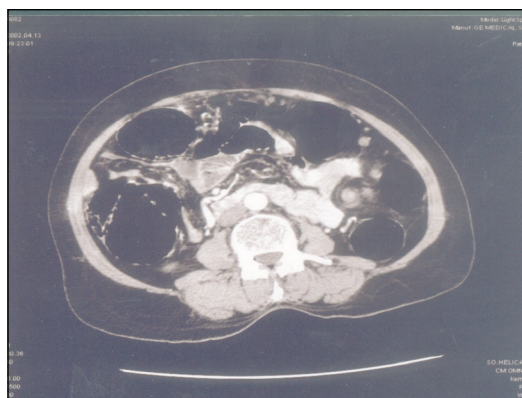
Figure 1 - Computerized tomography scan abdomen showing a twisted splenic pedicle