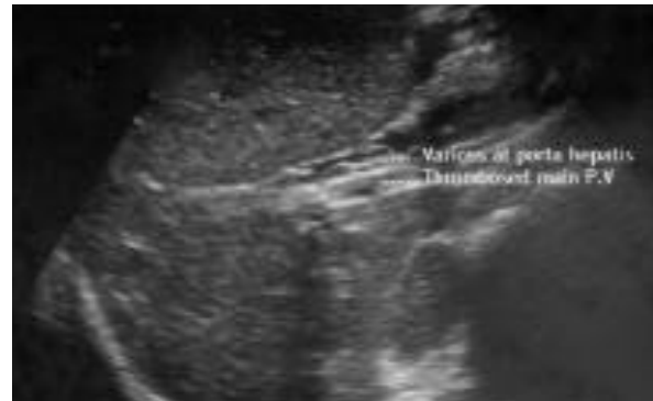
Figure 1 - Abdominal ultrasound at the level of portal vein (PV) showing thrombosis within the main portal vein with varicoses at porta hepatic.