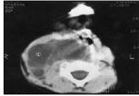
Figure 1 - Computerized tomography scan of the neck showing hemorrhage in a cervical lymphangioma.