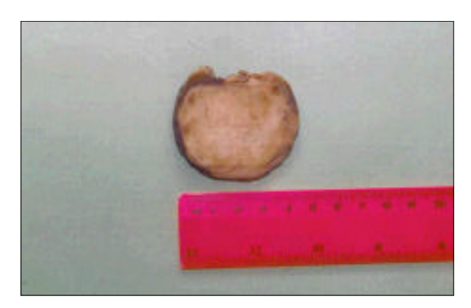
Figure 1 - Hemithyroidectomy specimen.