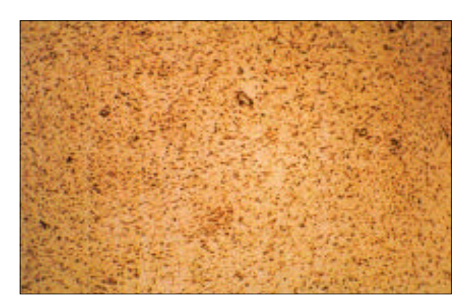
Figure 3 - Immunostaining shows strong reactivity of tumor spindle cells for vimentin (Vimentin x 200).

avidin-biotin performed using the The immunoperoxidase technique. following antibodies (immunostains) were applied on formalin fixed and paraffin embedded tissue sections, against different cellular antigens including pancytokeratin, thyroglobulin, calcitonin, vimentin, desmin, smooth muscle actin, CD99, CD34, bcl-2 oncoprotein, synaptophysin, chromogranin-A, neuron specific enolase, Factor-VIII, S-100 protein, and HMB-45. Microscopic examination revealed a haphazard arrangement of benign looking spindle cells with entrapped thyroid follicles (Figure 2). There were no necrosis mitoses. or cellular Immunohistochemical studies showed reactivity of tumor cells for vimentin (Figure 3) and focal reactivity for CD34, CD99, and bcl-2 oncoprotein. All other immunostains non-reactive.