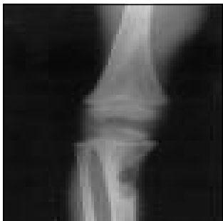
Figure 1 - Anteroposterior x-ray view of the right leg showing metaphyseal cortical defect in upper tibia surrounded by an intense sclerotic reaction. A second oval lytic bone lesion is also seen in lower femur. The radiological features are consistent with non-ossifying fibroma.

above described material showed a proliferating fibroblastic and spindle cell stroma with storiform features and a variable number of multinucleated giant cells (Figure 2). Elsewhere in the lesion, mononuclear inflammatory cells and a small number of histiocytes were also seen. Immunohistochemical stains showed strong and confluent positive staining with vimentin (mesenchymal cells marker) and negative staining with S100 protein (marker for Schwann cells). Based on the above histological features a diagnosis of non-ossifying fibroma (also called metaphyseal fibrous defect, fibroma and fibrous cortical defect) was made. Furthermore, clinicopathological and radiological correlation enabled us to label this patient as a case of Jaffe–Campanacci syndrome. 1,3