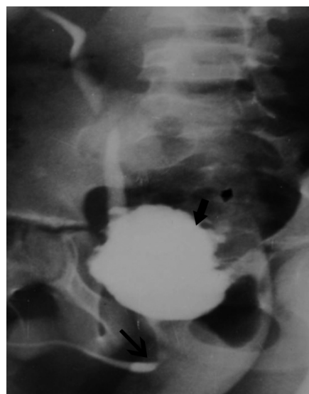
Figure 2 - Voiding cystourethrography showed an irregular bladder of small capacity with narrowing of the urethra at the level of the external sphincter and right reflux.

Discussion. The UFS or Ochoa syndrome is a rare disease with characteristic symptomatology consisting of recurrent urinary infections, incontinence, constipation, dysuria, frequency, and enuresis. These problems stem from a non-neurogenic neurogenic form of bladder dysfunction. Voiding cystourethrography typically reveals bladder trabeculation and vesicoureteral reflux. These patients have no apparent neurological or