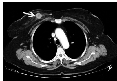
Figure 1 - Contrast enhanced computerized tomography of the chest showing a well defined enhancing mass in the right breast measuring 2 x 2 cm (arrow) consistent with the known primary breast tumor.

Surgical procedure. She was positioned prone with flexion of the thighs at 90°. The MI retroperitoneal right adrenalectomy was performed utilizing 2 ports sized 10mm and one port sized 5mm, a blunt dissection was initially used to create a retroperitoneal space under the 11th rib. The space is insufflated with CO 2 to a pressure of 20 mm Hg. A 30° scope was used for better visualization, and a 5 mm LigaSure vessel sealing and dividing instrument (Valleylab, Tyco, USA) to control the blood supply including the main vein; no clips or drains were used ( Figure 3 ). The dissection starts by opening the Gerota fascia, the upper pole of the right kidney is identified inferiorly in the view, the vena cava is identified laterally, and the paraspinous muscle is identified medially. The adrenal gland with the surrounding fat is retracted upward and dissected away from the superior pole of the right kidney; the vascular pedicles are identified and controlled. The gland is then extracted from the abdomen in an endo-catch bag. She had simultaneously right breast conserving surgery (lumpectomy + axillary dissection).