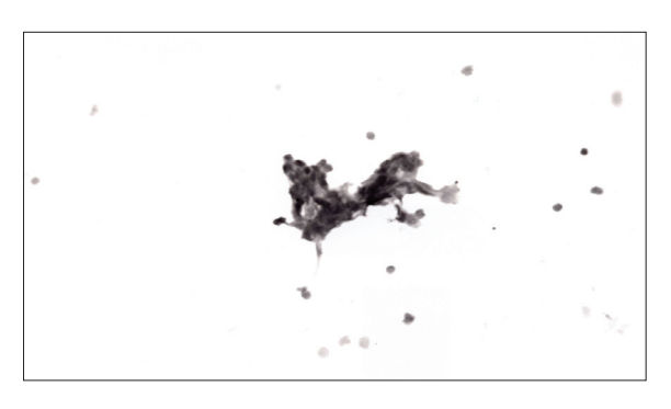
Figure 1 - Cluster of squamous tumoral cells in peripheral blood (staining: hematoxylin and eosin. Magnification: x 400).

Discussion. We observed micrometastasis in peripheral blood of 7 out of 21 (33%) patients