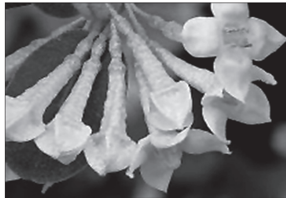
Figure 2 - Photograph showing mature flowers of Elaeagnus umbellata .