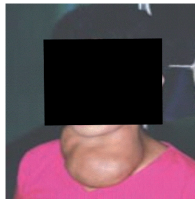
Figure 2 - Clinical improvement of the case after the first cycle of 6 cycles of chemotherapy.

The oncologist, obstetrician and surgeon decided an immediate plan of chemotherapy of cyclophosphamide, doxorubicin, vincristine, and prednisone (CHOP), 6 cycles, 3 weeks apart. She agreed and tolerated the first cycle well. She had an about 50% reduction in the size of the mass within 48 hours with complete disappearance of dyspnea and dysphagia but the hoarseness of voice showed little improvement ( Figure 2 ). The patient was discharged after 10 days of hospitalization, in a fair condition with a plan of antenatal care and scheduled 5 cycles of chemotherapy. She had uneventful antenatal visits at a weekly basis. Before delivery, she received 2 more cycles of chemotherapy. She had an induction of labor, at completed 36 weeks of gestation by using prostaglandin E 2 , as in our protocol. She delivered normally, a healthy baby girl 2.4 kg without congenital anomalies. She was discharged in the second postpartum day in a good condition and the thyroid mass was almost 5x5 cm. She was advised to complete the scheduled chemotherapeutic cycles, to prevent breast-feeding and to have contraception for life. She received her fourth cycle of chemotherapy, 2 weeks after delivery. Eight weeks after delivery, she was doing well and an IUCD was inserted. Six months after delivery, she remained in clinical and radiological complete response and the thyroid mass was almost 1x2 cm.