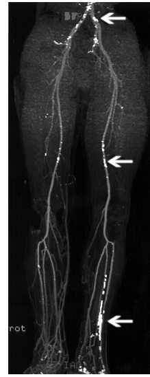
Figure 3 - Maximum intensity projection image showing multiple calcific plaques (arrows) lining the arterial tree.