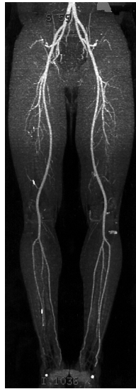
Figure 1 - Maximum intensity projection image showing the normal arterial tree of the lower extremities.