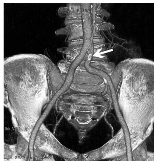
Figure 4 - Three-dimensional volume rendered image shows calcific plaques in left common iliac artery with focal stenosis (arrow).

of calcification within it. 8 This is significant as heterogeneous plaques are more prone to calcify while the soft plaques are more prone to dislodge and throw an embolus. In addition, by being able to more clearly define a plaque and its morphology, the effect of various therapies on progression or regression of the plaques can be monitored. However, the presence of very heavy calcification is a disadvantage for CTA, 9 as the vessels are then not adequately evaluated due to blooming artifacts, especially in smaller caliber vessels, beyond the level of the knee. 10 However, with the development of newer software algorithms, this drawback would be overcome very soon. The additional benefit of cross-