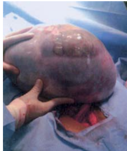
Figure 2 - The mass taken out from the abdomino-pelvic cavity.