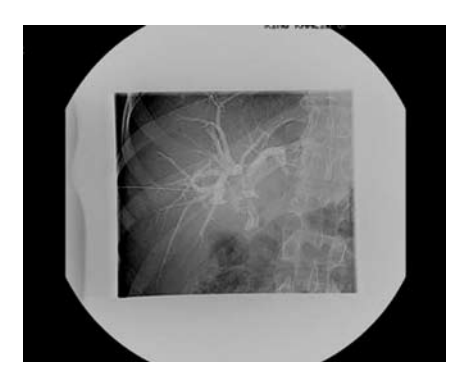
Figure 1- Image of the percutaneous transhepatic cholangiography showing dilated intrahepatic bile ducts with stricture at the site of previous hepaticojejunostomy.