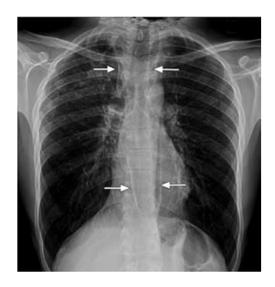
Figure 1 - Plain x-ray of the chest posterior to anterior view showed diffuse dilatation of the esophagus that appears as a tubular air filled structure seen in the mediastinum (arrows) that is seen extending downward along the diaphragm connected with the gas shadow of the stomach.

Discussion. Failure of separation of the esophagus and trachea in the early stage of embryonic development results in congenital fistula between the bronchus/