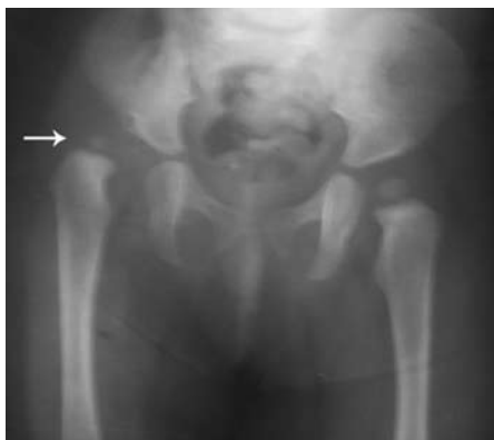
Figure 1 - Right hip dislocation in a girl of 13-months.

*For patients who had a bilateral dislocation, the second side is indicated by parentheses. CE angle - center-edge angle, AVN - avascular necrosis, DVO - Derotation varus osteotomy