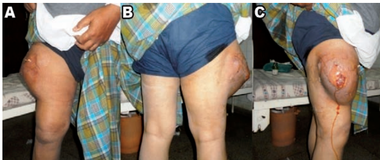
Figure 1 - Images showing: A) front; B) back; and C) side view swelling over the anterolateral aspect of the right thigh.