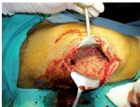
Figure 4 - Necrotic fat visible inside the subcutaneous space.