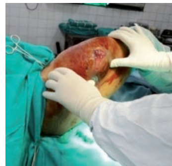
Figure 2 - Manual compression showing cystic nature of swelling.