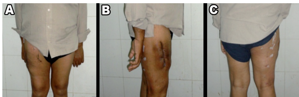
Figure 6 - Images showing near normal contour: A) front; B) side; and C) back of the thigh 6 weeks after surgery.