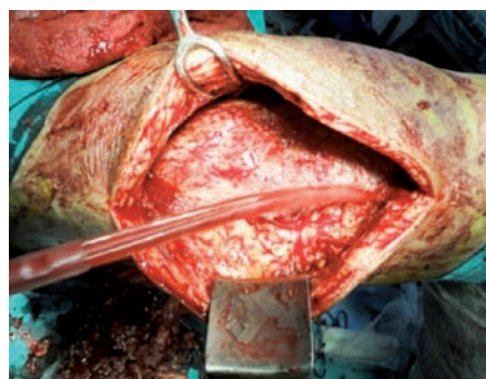
Figure 5 - Wound debridement with fresh bleeding surface.