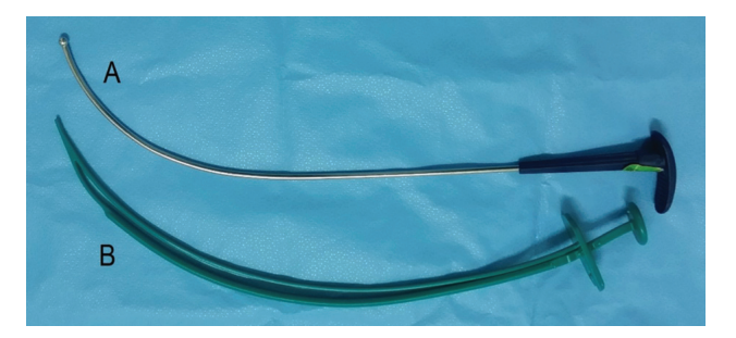
Figure 1 - Photograph of A) Gliderite<sup>®</sup> rigid stylet and B) Parker Flex-It stylet.

Fresenius, Fresenius Kabi, GmbH, Graz, Austria), fentanyl 2 ug/kg IV (Janssen-Cilag, Beerse, Belgium), and cisatracurium 0.15 mg/kg IV (GlaxoSmithKline S.p.A. Parma, Italy) to facilitate tracheal intubation, then the patient's lungs was ventilated by a face mask with sevoflurane (2.0-2.5%) in 100% oxygen for at least 90 second to allow full relaxation of the jaw and until no twitches by nerve stimulator monitor were present, at which point all patients received orotracheal intubation by GlideScope<sup>®</sup> videolaryngoscope of appropriate size according to the manufacturer's label information. The ETTs (Rüschelit; Teleflex Medical, Research Triangle Park, NC, USA) used were styletted in accordance to the randomized allotment.