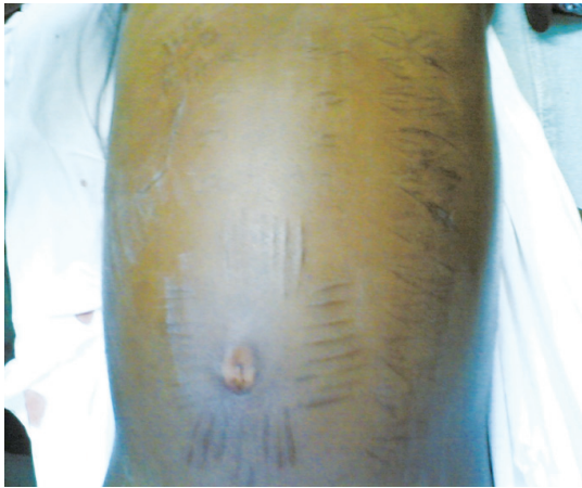
Figure 1 - Distended abdomen with multiple scarifications.