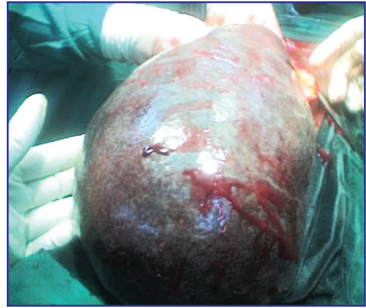
Figure 2 - Massively-enlarged spleen observed at operation.

complete blood count showed a low hematocrit (34%) (normal range: 42-54%), elevated total white blood cell count ( 17,000/\text{mm}^3 ) (normal range: 4,000 to 11,000/\text{mm}^3 ), and thrombocytopenia ( 85,000/\text{mm}^3 ) ( 150,000\text{-}450,000/\text{microliter} ). Electrolytes, urea and creatinine and urinalysis were normal. Abdominal ultrasound revealed a massively-enlarged spleen (30 cm in its long axis) with pericapsular fluid collection extending from the inferior margin of the left sub-costal region to the right iliac fossa, and fluid collection in the left paracolic gutter. There was left hydronephrosis. Abdominal computed tomography scan demonstrated absence of spleen in the normal splenic area, soft tissue structure with well-defined borders extending into the pelvis and intra-abdominal fluid, with a conclusion of ectopic spleen.