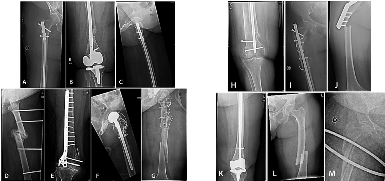
Figure 1 - X-rays of 15 patients with atypical fracture femoral: A) transverse fracture of mid femoral shaft with intramedullary nailing, B) transverse fracture of mid femoral shaft with intramedullary nailing and atrophic non-union 10 months after the fracture, C) greenstick fracture of mid femoral shaft, D) displaced oblique fracture of mid femoral shaft, callus formation around the fracture site, with plate, E) comminuted fracture of distal femoral shaft with non-union 9 months after plate fixation, F) hemiarthroplasty in a comminuted proximal hip fracture, G) comminuted mid shaft fracture with wires and non-union 10 months after the fracture. H) displaced comminuted fracture of distal femoral shaft after intramedullary nailing. I) non-union comminuted fracture of proximal femoral shaft with intramedullary nailing. J) transverse displaced fracture of mid shaft in a patient with old operated hip fracture, K) comminuted fracture of distal femoral shaft fixed with a plate in a patient with knee replacement, L) Greenstick fracture of mid shaft with hypertrophid union after intramedullary fixation, M) Greenstick fracture of mid shaft with non union after intramedullary fixation in a patient with knee replacement, N) displaced transverse fracture of mid femoral shaft, O) spiral fracture of proximal femoral shaft.