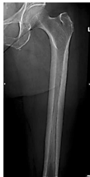
Figure 5 - X-ray femur of a 66 years old lady complaining of chronic severe thigh pain after receiving alendronate for 10 years. It shows marked cortical thickening.

risk factors are use of PPI, cancer, or simultaneous use of other antiresorptive drugs. Neither presence of previous fractures, nor bone density results can predict the risk of atypical fractures. All patients in our report are PPI users. It is not possible to assess risk of AFF in postmenopausal osteoporosis after prolonged use of BPs. It is probably beneficial to study the pre-treatment state of bone turnover. Do patients with low bone turnover have higher risks?