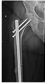
Figure 4 - X-ray of a 70-year-old lady with rheumatoid arthritis after 4 years of alecta. It shows old fracture of right femoral head, intramedullary nailing, recent transverse fracture (greenstick) of femoral shaft and clear cortical thickening.