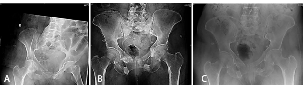
Figure 3 - X-ray showing A) acute spontaneous pelvic fracture in a 66 years old lady who used alendronate for 15 years, B) non-union of pelvic fracture after one year, and C) healing of pelvic fracture after 2 years of teriparatide.

with teriparatide 20 mcg daily for 18-24 months. Sixteen fracture patients completed the teriparatide course (18-24 months), 11 (68.75%) patients showed complete healing of the fracture at the end of the course (Figure 6), 5 patients (31.25%) remained with nonunion of fracture (3 tibiae, 2 femoral shaft), and 7 patients (33.3%) were lost to follow up. Group 3 patients reported marked improvement in pain and the ability to walk, but remained with mild pain 3 years after completing teriparatide. Bone density using a bone density measurement scan at the time of presentation showed osteopenia in 6 patients in group 2 patients, and all of the group 3 patients. There was osteoporosis in 15 of the group 2 patients.