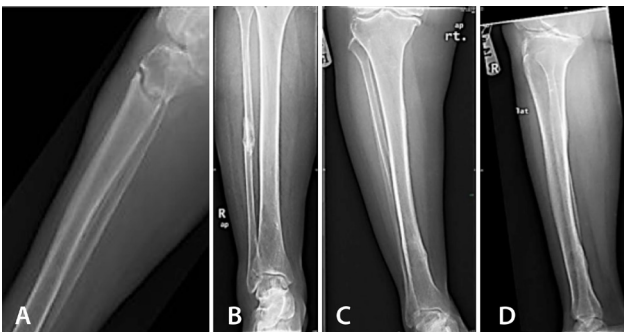
Figure 2 - X-ray showing A) transverse fracture of upper tibia with non-union one year after fracture, B) comminuted fracture of fibula, and C) & D) greenstick fractures of lower tibia.