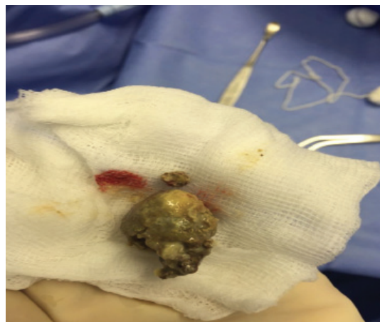
Figure 2 - A giant tonsillolith extracted of left tonsil.

Disclosure. Authors have no conflict of interests, and the work was not supported or funded by any drug company.