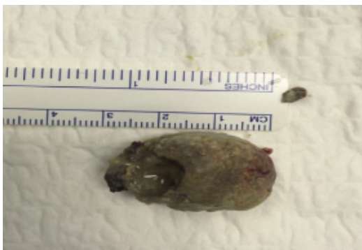
Figure 3 - Tonsillolith measured 3.1 × 2.3 cm.