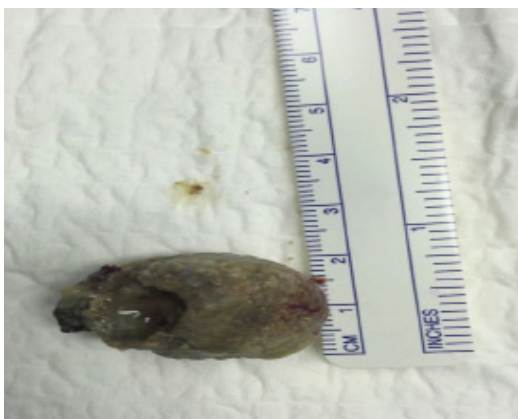
Figure 4 - Tonsillolith measured 3.1 × 2.3 cm.

calculi. One hypothesis attributes stone formation to recurrent tonsillitis and subsequent crypt fibrosis that lead to epithelial cell retention, which creates an environment for microorganism overgrowth and calcification due to deposition of inorganic salts from salivary gland secretions. 5 Stoodley et al 6 concluded that tonsilloliths share common characteristics with biofilms. Biofilms are aggregates of aerobic and non-aerobic microorganisms enclosed in an extracellular matrix. Due to the nature of biofilms, it is difficult to treat the microorganisms with antibiotics. In fact, a biofilm serves as a nidus for acute infections rendering it a source of recurrent ENT infections. 7 Cases of giant tonsillolith have not been reported in Saudi Arabia. Literature review shows that the largest tonsillolith was reported in a 12-year-old female child in the left tonsil and measured 4.2 × 3.6 × 2.1 cm. A majority of the cases of giant tonsilloliths reported a left tonsil stone rather than the right. Two reported cases showed bilateral giant tonsilloliths. 8,9 A patient with tonsillar stone is approached through history taking, physical examination, and imaging studies. A giant tonsillolith