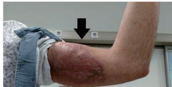
Figure 3 - The image of the lesion 35 days after skin auto-graft.

between April and October. In our case, the patient worked outdoors and presented with spider bite in June. Loxosceles reclusa venom, both hemolytic and cytotoxic, is the most potent of all spider venoms and contains several enzymes that cause clinical symptoms. 1 Among them, sphingomyelinase D governs toxin-mediated hemolysis and complement-mediated erythrocyte destruction and can cause cutaneous conditions by way of synergistic effects. 2 The venom also contains proteases that break down collagen, fibronectin, fibrinogen, and elastin-basement membranes.