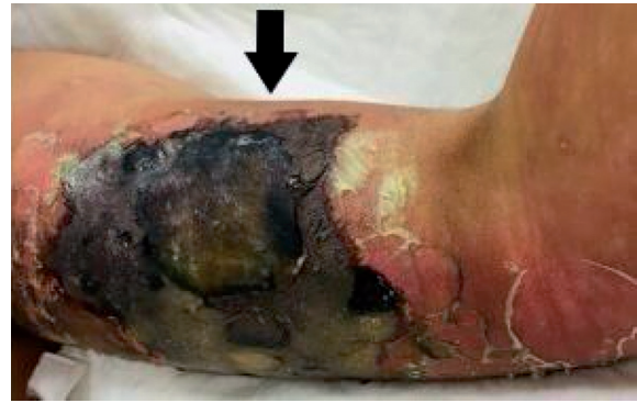
Figure 2 - The lesion image after skin debridement.