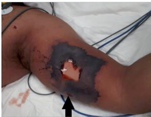
Figure 1 - The lesion image in the intensive care unit admission. The lesion 10 × 20 cm with central necrosis, peripheral erythema, and edema in the middle third of the left upper arm.

Discussion. Generally present in dark places, including lofts, basements, and beneath rocks and trees, L. reclusa are known to bite humans, most often