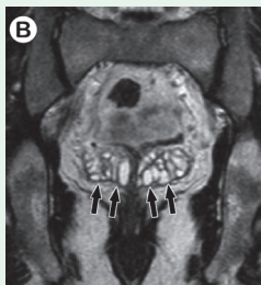
Coronal T2-weighted MRI image showing dilated seminal vesicles (arrows)