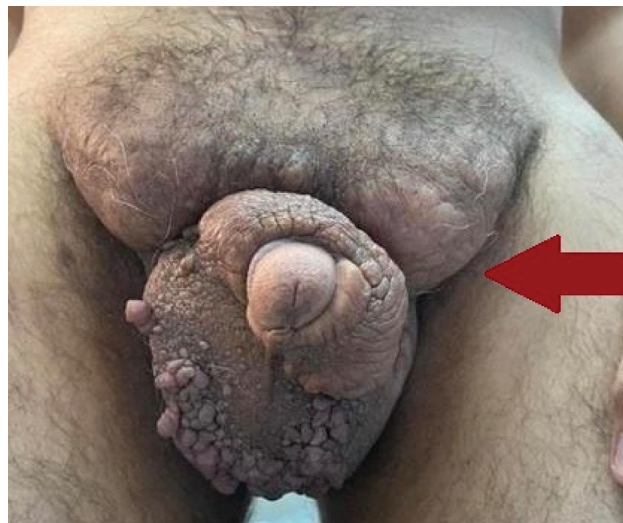
Figure 1 - Penoscrotal lymphedema.

Discussion. Hidradentis suppurativa, also known as acne inversa, is a chronic inflammatory cutaneous disease affecting apocrine gland bearing areas. 1 Lymphedema is a well-described complication of HS affecting more males than females. It involves the scrotum, penis, labia majora, perineum, groin, buttocks, and abdomen. 2 Penoscrotal lymphedema is the most common presentation of lymphedema secondary to HS. 2 Furthermore, genital lymphedema usually develops after 4-30 years of chronic HS. 2 However, our