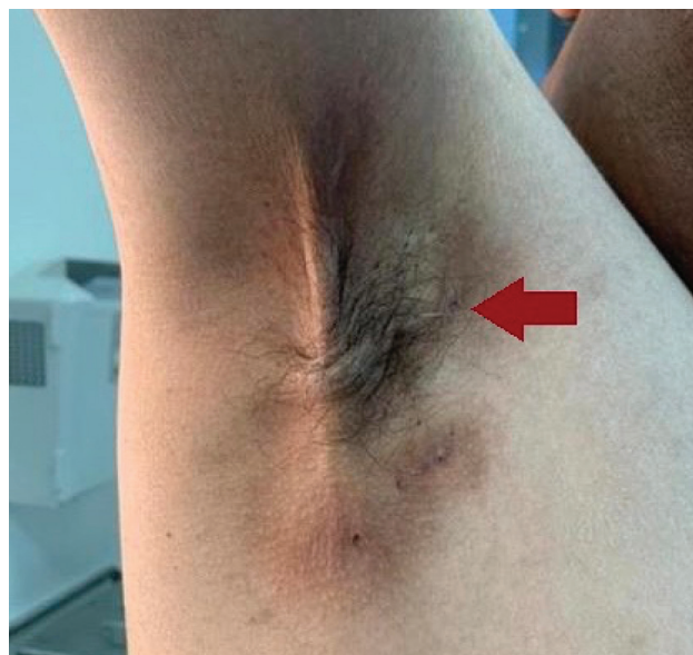
Figure 2 - Mild hidradentis suppurativa with only post inflammatory hyperpigmentations. He gets occasional small nodules that get resolved with topical treatment.