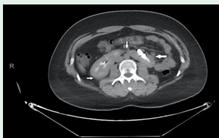
Axial section of computed tomography urogram with a delayed film of a 27-year-old Saudi male. The section shows fused kidneys in the midline (a horseshoe kidney) (white arrows). The contrast appears bright white in the renal pelvis.

Ayed et al present a 27-year-old male patient presented with mild recurrent lower abdominal pain associated with dysuria. No history of renal disease. Laboratory investigations revealed red blood cells (RBC), white blood cells (WBC), and bacterial growth in the urine. A CT urogram showed an Horseshoe kidney (HSK) with a unilateral left-sided ureter. The patient was diagnosed with a urinary tract infection (UTI) and managed with regular follow-up. An HSK with a unilateral left-sided normally implanted ureter is rare. The present case of HSK was associated with recurrent UTI, which was managed accordingly.