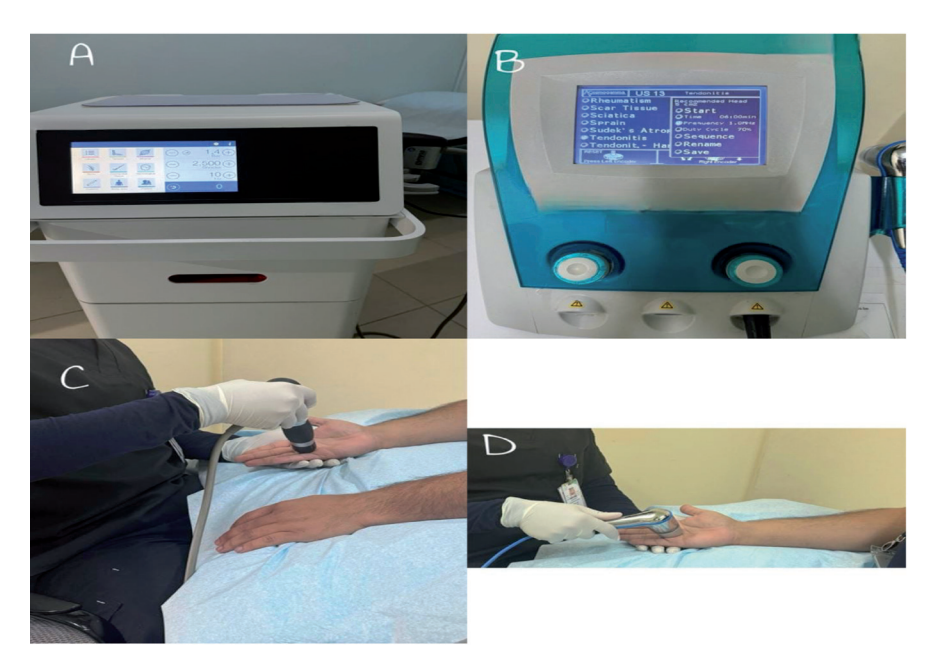
Figure 1 - The figure illustrates the treatment techniques provided with parameters as following: A) Extracorporeal shockwave therapyparameter: 2,500 impulses, 1.4 bar, 10Hz, head diameter 2cm. B) Ultrasound parameter: 1.0MHz, 70% duty cycle. 6 min., head diameter 3.5 cm. C,D) The treatment posture: patients sitting with their elbow flexed 90 degrees, shoulder adducted beside their body and forearm in supination.

In terms of the immediate results, both the ESWT and the US groups showed a significant improvement (p<0.05 in all outcomes [pain severity, proximal interphalangeal [PIP] joint ROM, distal interphalangeal