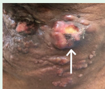
Large ulcerative tumor 7.7 cm in the left axilla

Alamri et al present a unique case of cutaneous metastasis of signet ring adenocarcinoma. A 65-year-old Saudi male sought medical advice in July 2020, after developing nausea, vomiting, abdominal pain, and constipation. Histopathology confirmed the diagnosis of mucinous adenocarcinoma of the left colon, and staging was determined as PT3N2Mx in August 2020. The patient presented with generalized asymptomatic subcutaneous nodules 2 years after primary tumor diagnosis. Skin metastasis appeared 3 months before the liver and lung metastasis. However, the patient died 4 months later. They concluded that clinicians should observe signs of distant metastasis of colorectal cancer to enhance survival and improve outcomes.