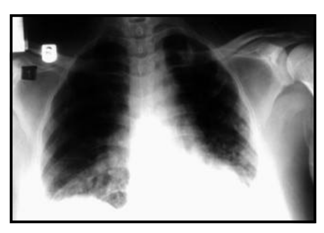
Figure 1 - CXR on admission showing right lung consolidation with air bronchogram.

agglutinin and mycoplasma culture were negative. showed consolidation with air Chest x-ray bronchogram in the right lower lobe and areas of calcification in the left upper lung (Figure 1). The patient was diagnosed as having community acquired pneumonia for which erythromycin and cefuroxim intravenously were given. Two-days later, pseudomonas aeruginosa was isolated from the sputum and then antibiotics were changed to ceftazidme and gentamycin. Initially patient's condition showed slight improvement as fever and cough subsided and the inspiratory crackles