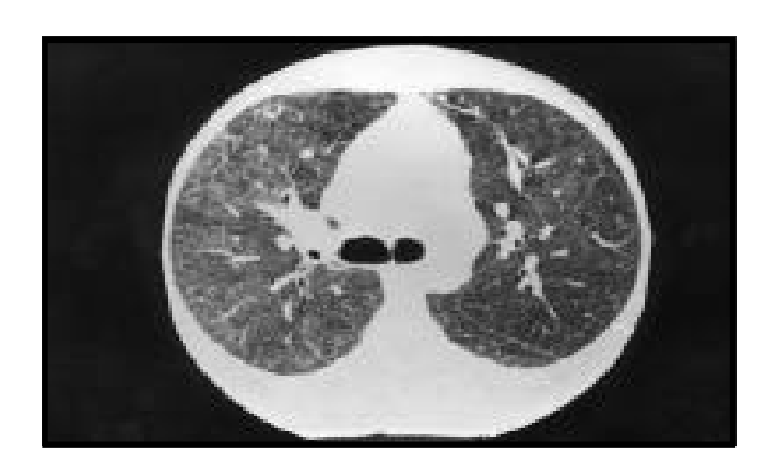
Figure 2 - CT scan of chest parenchymal window showing diffuse ground glass appearance of pulmonary hemorrhage.

Four months later, the patient was re-admitted with recurrent hemoptysis, progressive shortness of breath, and severe hypoxia. Investigations at this time showed iron deficiency anemia with a hemoglobin of 9.6 g/L. Chest radiography showed bilateral air-space consolidation and lung CT scanning showed diffuse ground glass opacification