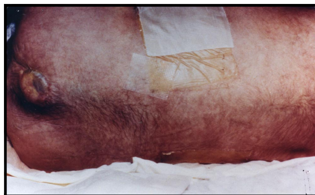
Figure 2 - Photograph of the same patient shows sacral meningomyelocele and imperforate anus. (Patient's chest is at right side of picture, pelvis at the left).