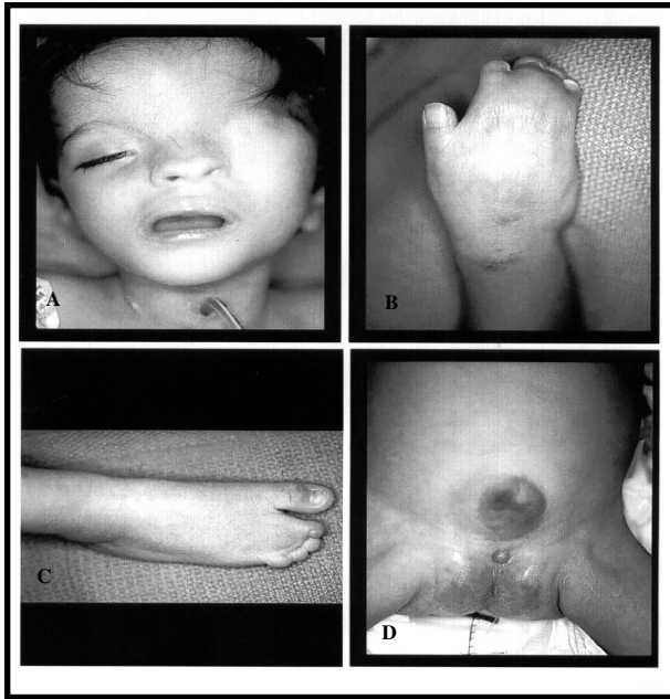
Figure 1 - Clinical photograph showing: (a) Cryptophthalmos and tracheostomy (for laryngeal stenosis); (b,c) Syndactyly of hand and foot; (d) Lower abdominal hernia, a low set umbilicus and clitorimegaly.