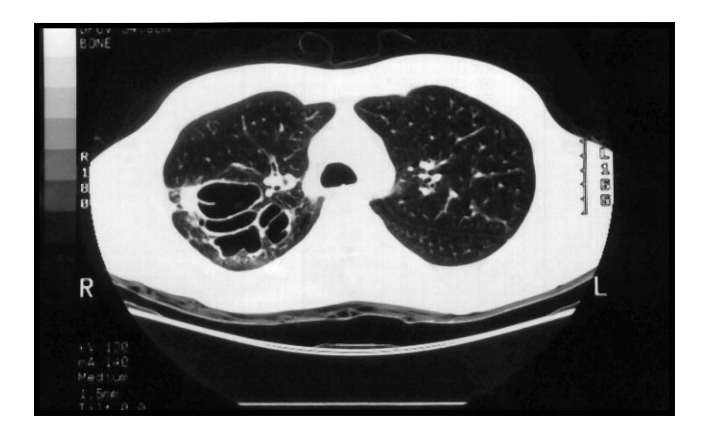
Figure 4 - Patient 2 - Chest radiograph showed well defined thin cystic bronchiectatic changes surrounded by mild parenchymal infiltrates at the right upper lobe.

1998 due to a poor response to antituberculous therapy as well as for the control of his asthma. The diagnosis of pulmonary tuberculosis was based only on the presence of radiological cystic bronchiectatic changes affecting mainly the apical zone of the right lung. As at that time, his Ziehl-Neelsen stain for AFB was negative in the sputum and in the bronchial lavage as well as his tuberculin test. He was known asthmatic for almost 20 years. His asthma was poorly controlled on inhaled Ventolin therapy. In the past 2 years he became more symptomatic and visited the emergency room regularly. At our institution he presented with shortness of breath, cough, productive greenish sputum, wheezes and right sided chest pain.