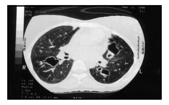
Figure 2 - Patient 1 - High resolution computed tomography (HRCT) scan of the chest showed central bronchiectatic changes of cylindical type affecting both lungs.

Patient 2. A 27-year-old gentleman was diagnosed to have pulmonary tuberculosis in June 1998. He was referred to our institution in September