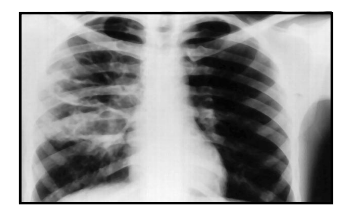
Figure 5 - Patient 2 - High resolution computed tomography (HRCT) scan of the chest showed wide spread central bronchiectasis affecting the posterior and the apical segments of the right upper lobe.