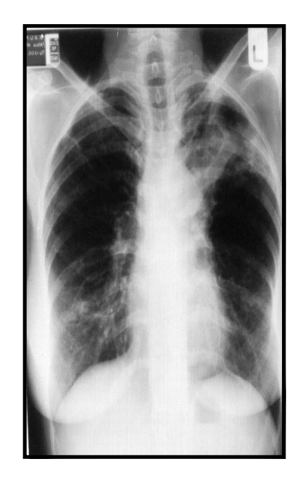
Figure 1 - Patient 1 - Chest radiograph showed ill defined opacity with irregular thickened wall cavity affecting left upper zone. There is right apical infiltration and multiple different sized and shaped cavities on both lung fields.

was kept on 40 mg/day prednisone for one month. This was tapered gradually once her symptoms, IgE level and chest radiograph improved. Currently she is on 10 mg prednisone/day orally. Her last IgE level had decreased to 1243 IU/ml as well as her eosinophilic count to 0.073 \times 10^3 cells/mm<sup>3</sup>. Recent chest radiograph showed complete resolution of lung opacities (Figure 3). Peak expiratory flow rate has risen to 330L per minute.