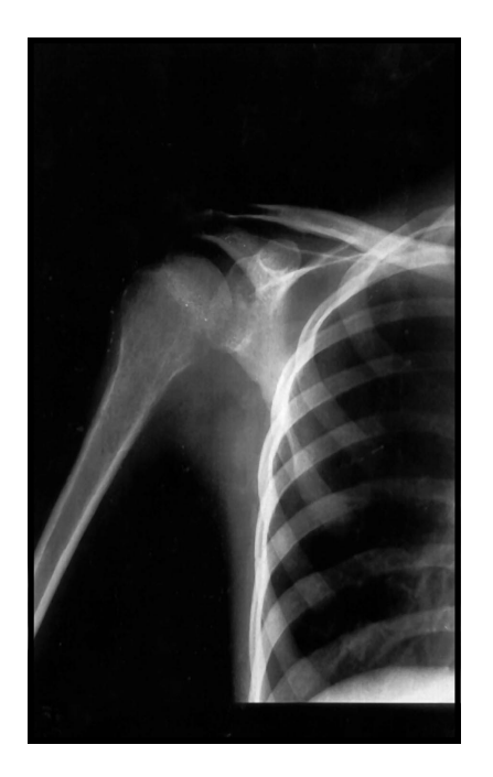
Figure 2 - X-ray of the right shoulder showing multiple radiolucent areas in the proximal humerus with erosion of the medial aspects of the head and neck.

allopurinol was initiated. The leukocyte count dropped slowly, but overall, the patients condition remained the same with persistent right shoulder pain and fever. In June 1999 the patient was seen in our hospital with worsening of her right shoulder pain. In addition, she reported a new onset of left shoulder and bilateral hip and knee pain. There was no history of morning stiffness or small joint pain. The physical examination of the right shoulder showed swelling, hotness, and extremely painful movement of both abduction and external rotation. Her hips were tender with painful restriction of the abduction and the