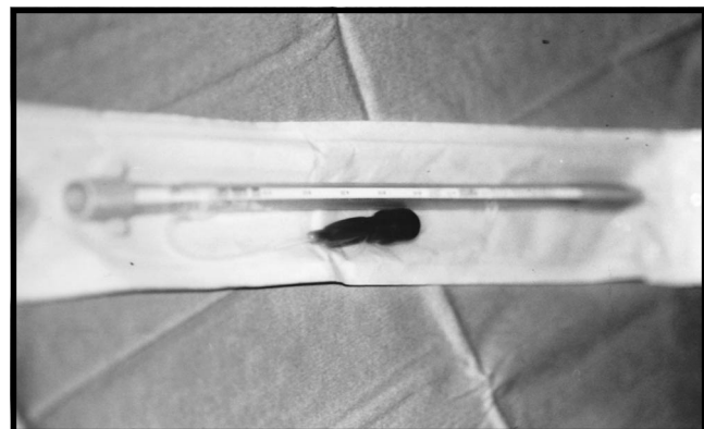
Figure 2 - Photograph showing a size 7 mm re-inforced endotracheal tube, the type normally employed in these cases.