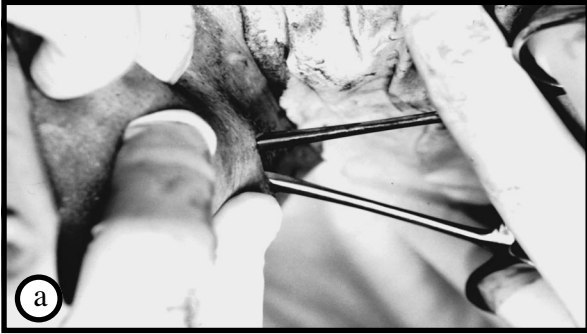
Figure 3 - Intraoperative photographs showing stage-by-stage approach of the laterosubmental incision a) blunt dissection with large curved artery forceps. b) Incision and introduction into the mouth.