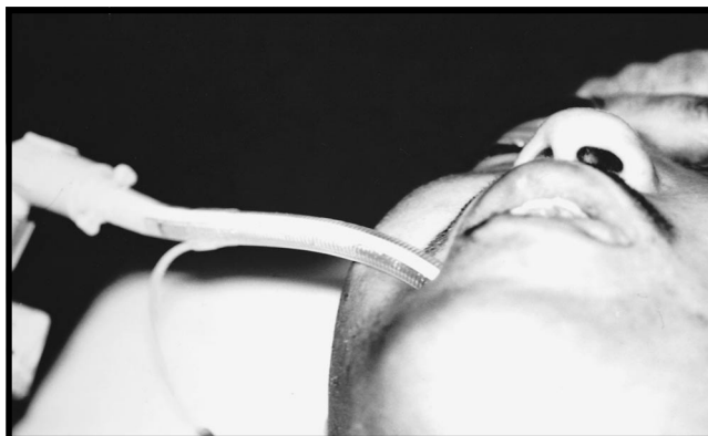
Figure 1 - Intraoperative photograph showing patient with oroendotracheal intubation in place.