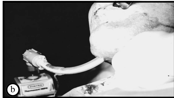
Figure 4 - The deflated cuff and tube have been fed into the hemostat a) successfully withdrawn submentally b) reconnection to anesthetic machine.