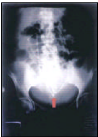
Figure 3 - Bilateral double J ureteric stent with acute kinking of the stent.

unit. Central venous pressure line was inserted and 2 units of packed cells were transfused. At cystoscopy revealed an elongated, compressed urinary bladder. Computerized tomography (CT) scan of abdomen and pelvis revealed a hematoma pushing the bladder posteriorly, with mild dilatation of the right kidney and ureter ( Figure 1 ). Cystogram revealed, the bladder was severely compressed and elongated for approximately 15 cm ( Figure 2 ). Bilateral double-J ureteric stent, (28 cm 8F) were inserted with difficulty, followed by 20F Foley's catheter ( Figure 3 ). A scanty concentrated, blood-stained urine was drained. The urine increases and cleared gradually. Serum creatinine became normal after 24 hours. Heparin S/C was resumed followed by Warfarin, both adjusted, according to coagulation profile. Heparin was stopped after 8 days. Foley's catheter was removed on the 14th day. She was discharged in satisfactory condition with the ureteric stents. She remained well 4 weeks later. On the 14th week, a repeat CT scan revealed a marked reduction in the size of the hematoma. Ureteric stents were removed after 17 weeks.