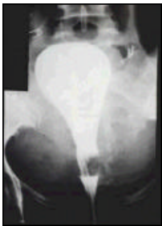
Figure 2 - Cystogram showing the compressed and elongated bladder for approximately 15 cm.