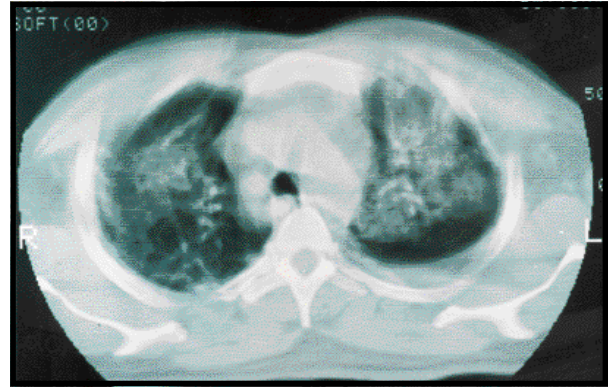
Figure 2 - Computerized tomogram of the chest (lung window) showing bilateral partially homogenous opacities and pleural effusions.

Table 1 - Profile of laboratory investigation during the course of illness.