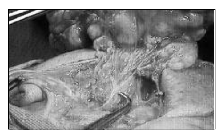
Figure 3 - Intraoperative view showing main trunk of the facial nerve indicated by a right angle clamp, just proximal to its divisions, at final stage of dissection. Note the delicate and transparent capsule engulfing the mass.