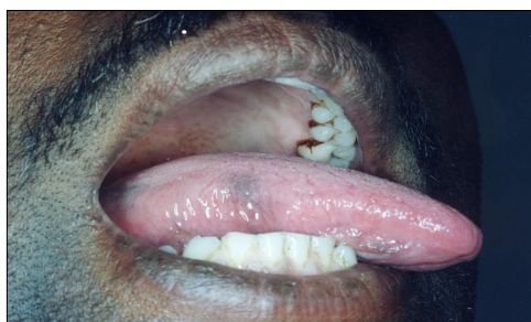
Figure 1 - Amlodipine associated hyperpigmentation a) photoaccentuated dark brown cutaneous pigmentation and b) small keratotic papules on the cheek, slate-gray patchy discoloration of the lips and tongue, and pinpoint brown macules on the hard palate.