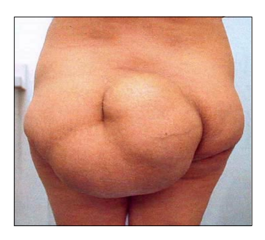
Figure 1 -A huge mass about 20 x 20 cm occupying the left gluteal area extending to the right gluteal region. Surface is smooth irregular with firm to hard in consistency. Prominent veins can be seen on the surface.