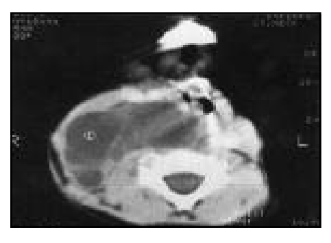
Figure 1 - Computerized tomography scan of the neck showing hemorrhage in a cervical lymphangioma.