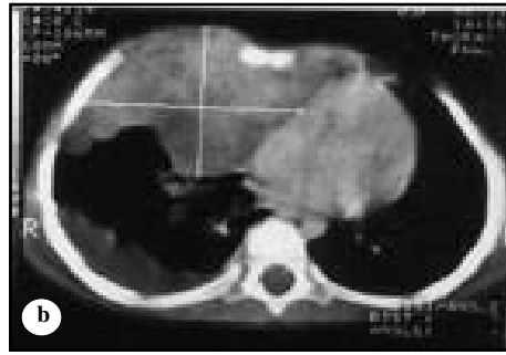
Figure 3 -Computerized tomography showing a large lymphangioma a) involving the right thoracic cavity b) its attachment to the anterior chest wall as well as the septae separating the different cysts.