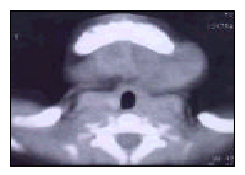
Figure 2 - Computerized tomography scan of the neck showing extensive lymphangioma of the floor of the mouth and left parotid gland.