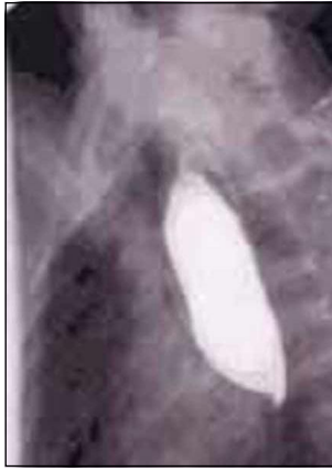
Figure 1 - Complete esophageal stenosis, with proximal dilation.