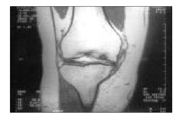
Figure 4 - Coronal magnetic resonance imaging of the knee using 3 dimensional double-echo steady state technique: showing osteochondritis dessicans of the medial femoral condyle, tear of the medial collateral ligament and abnormal signal of the lateral meniscus.

difficult to visualize than others such as the inferior surfaces of the posterior third of the meniscus.<sup>16,17</sup> These were the areas subsequently shown to have the highest rates of false positives.<sup>18</sup> In most of similar studies, a higher false positive rate was noted than false negative rates in meniscal injuries.<sup>19</sup> This is mostly explained by the fact that intra-substance tears, which can be seen in MRI, are usually not visible during arthroscopy. It has been well documented that MRI can detect intra-meniscal degenerative changes not visualized at arthroscopy<sup>20</sup> If during MRI the increased linear signal is seen to reach to an articular surface on both coronal and sagittal images, the possibility of the tear becomes higher. But, if seen only in one set of images then the tear is probably small and not identifiable on arthroscopy. Sometimes it may be particularly difficult to ascertain whether the signal reaches to articular surface. False negatives were an predominantly reported at the periphery of the menisci and were attributed to volume averaging, where subtle tears are averaged within the thickness of the slice. On retrospective review, one cases with