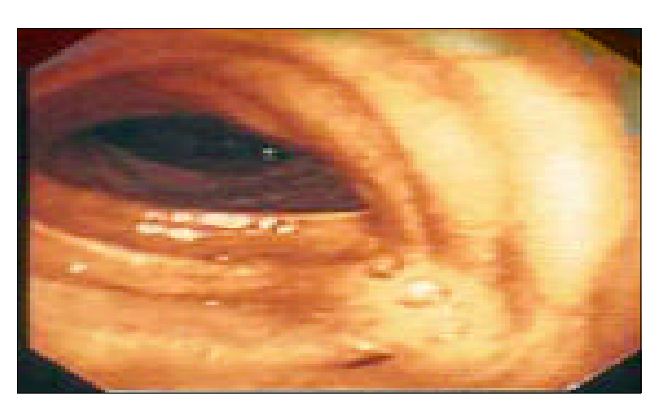
Figure 3 - Bronchoscopic picture of the trachea with tracheal dilatation, and diverticula in the posterior right tracheal wall (at 5 o'clock).

bronchi were 2.5 mm. Lower lobes showed area of