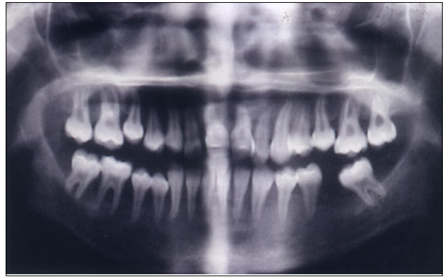
Figure 4 - Orthopantomogram showing extensive destruction of alveolar bone especially around the first molars.

improvement in palmar plantar keratosis. Since the dental condition remained stable, no active intervention was suggested. Patient is still on regular recall.