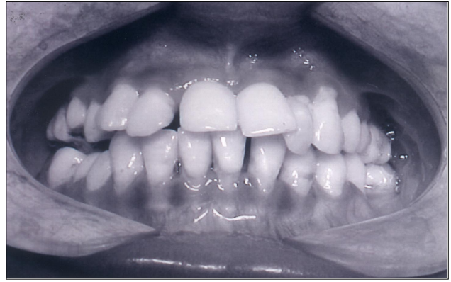
Figure 3 - Intra oral photograph showing advanced periodontal destruction resulting in drifting and extrusion of the teeth.