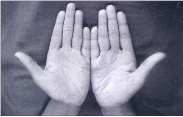
Figure 1 - Palms showing diffuse hyperkeratotic areas.