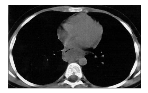
Figure 1 - Abcess in the posterior esophageal wall.