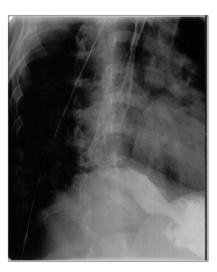
Figure 3 - Complete healing after 15 days, with mild irregularity.

was left in place and a naso-gastric tube was inserted. The postoperative course was uneventful. Due to the large size of the perforation, solid oral feeding was postponed for 2 weeks ( Figure 3 ). Follow up for more than one year by upper gastrointestinal series and endoscopies showed adequate healing without any stricture.