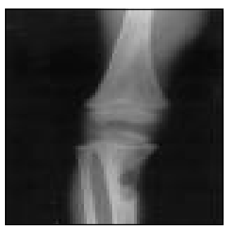
Figure 1 - Anteroposterior x-ray view of the right leg showing metaphyseal cortical defect in upper tibia surrounded by an intense sclerotic reaction. A second oval lytic bone lesion is also seen in lower femur. features are consistent with non-ossifving fibroma.

above described material showed a proliferating fibroblastic and spindle cell stroma with storiform features and a variable number of multinucleated giant cells (Figure 2). Elsewhere in the lesion. mononuclear inflammatory cells and a small number of histiocytes were also Immunohistochemical stains showed strong and confluent positive staining with vimentin (mesenchymal cells marker) and negative staining with $100 protein (marker for Schwann cells). Based on the above histological features a diagnosis of non-ossifying fibroma (also called metaphyseal fibrous defect, fibroma and fibrous cortical defect) was made. Furthermore, clinicopathological and radiological correlation enabled us to label this patient as a case of Jaffe-Campanacci syndrome. 1-3